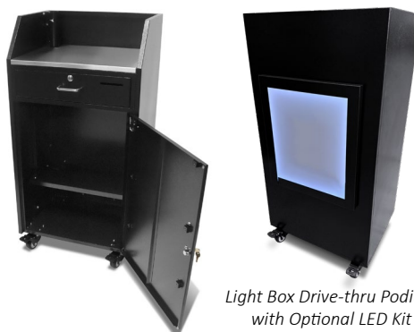
Light Box Drive-thru Podium with Optional LED Kit

The intelligent design offers the added benefit of space to secure, and organize supplies.